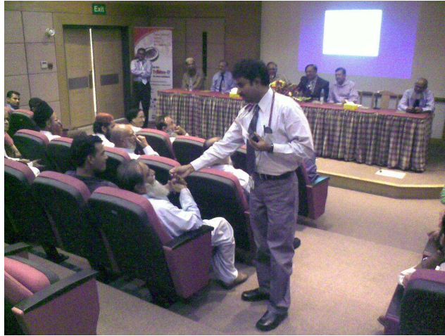
The expert panel answering the queries raised by general public at a session arranged at Tabba Heart Institute Karachi.