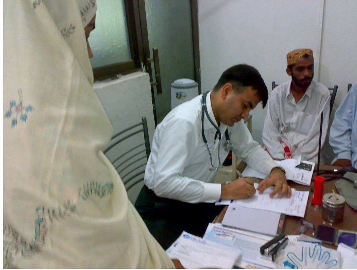
Screening camp at Civil Hospital Sukkur.