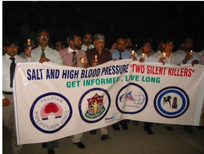
A candlelight walk at Faisalabad

A public awareness session was also arranged at Punjab Medical College on 26 th May 2009. Prof Ahmed Bilal delivered his talk on hypertension, its control and treatment options. This was followed by a candlelight walk in which all the prominent doctors and general public participated at large.