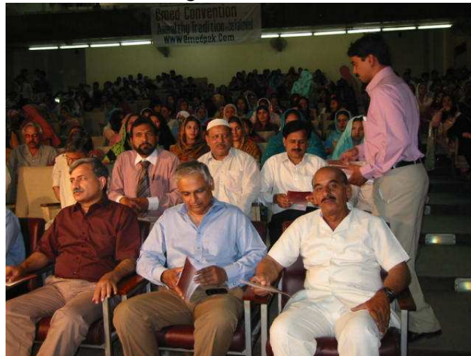
Public awareness session at Punjab Medical College Faisalabad.