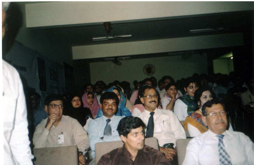
Public awareness session at ISRA University Hyderabad.

Blood Pressure monitoring was arranged at the site which facilitated the masses. Hypertension awareness booklets were also distributed at PharmEvo's stall.