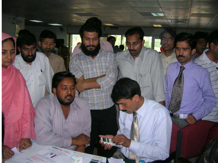
Screening camp at Sheikh Zayed Hospital Lahore.