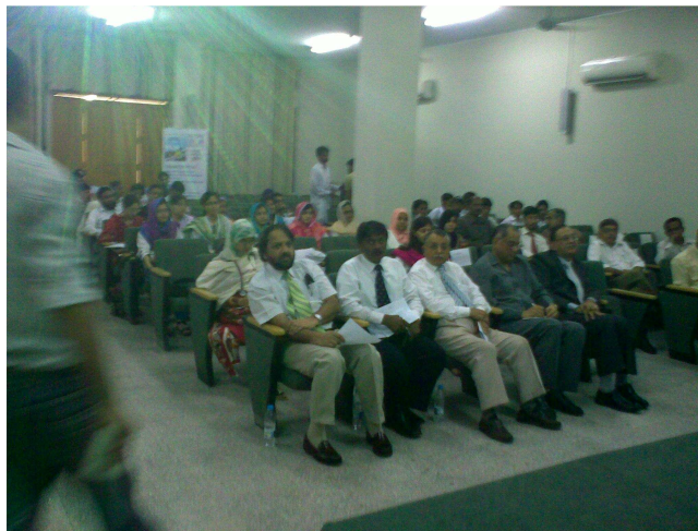
Scientific session at Abbasi Shaheed Hospital Karachi.