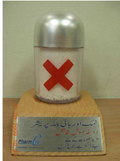
This souvenir has been specially designed by PharmEvo on World Hypertension Day 2009.

The World Hypertension Day was an excellent opportunity to undertake a concerted public information campaign and related activities that would draw attention to this killer disease. These series of activities benefited the general public at large and enabled us to raise awareness about hypertension, “the silent killer”.