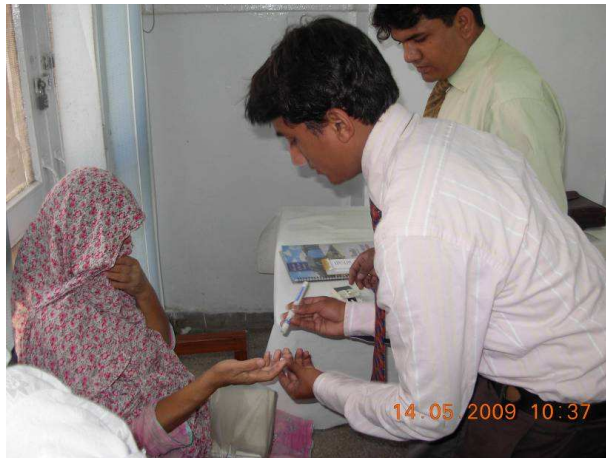
A woman going through cholesterol screening at FGSH Islamabad.

Dr. Shahbaz Kureshi delivered the day's speech highlighting the factors which develops high blood pressure and the control and treatment options. The speech was followed by a question answer session which was actively participated by every individual present in the hall. Hypertension awareness booklets were also distributed among the attendees.